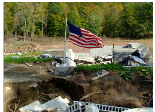
Esperance, N.Y., September 26, 2011 — Residents along Priddle Road suffer a total loss of structure due to heavy flooding caused from Hurricane Irene and Tropical Storm Lee.

Flood damages were severe in many communities, as the Susquehanna River hit a new record, exceeding the benchmark flood for the region set by Hurricane Agnes in 1972 by nearly two feet. Floodwalls in downtown Binghamton, N.Y., were